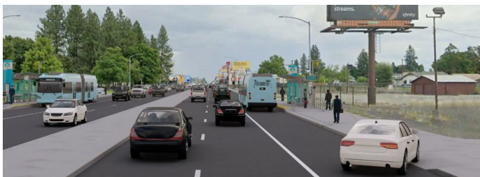
Rendering of northbound Bus Rapid Transit service along Division Street near Empire Avenue featuring BAT lanes